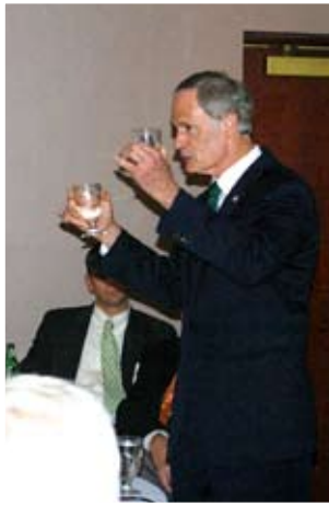
Senator Tom Carper likens infrastructure funding to moving water from one glass to the other