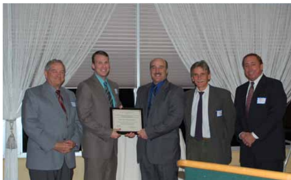
Grand Conceptor Award – Green Stone Engineering, LLC